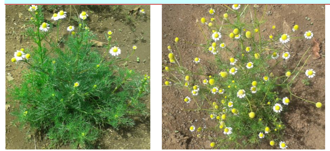
Matured flowered chamomile plants of two varieties used in the experiment.