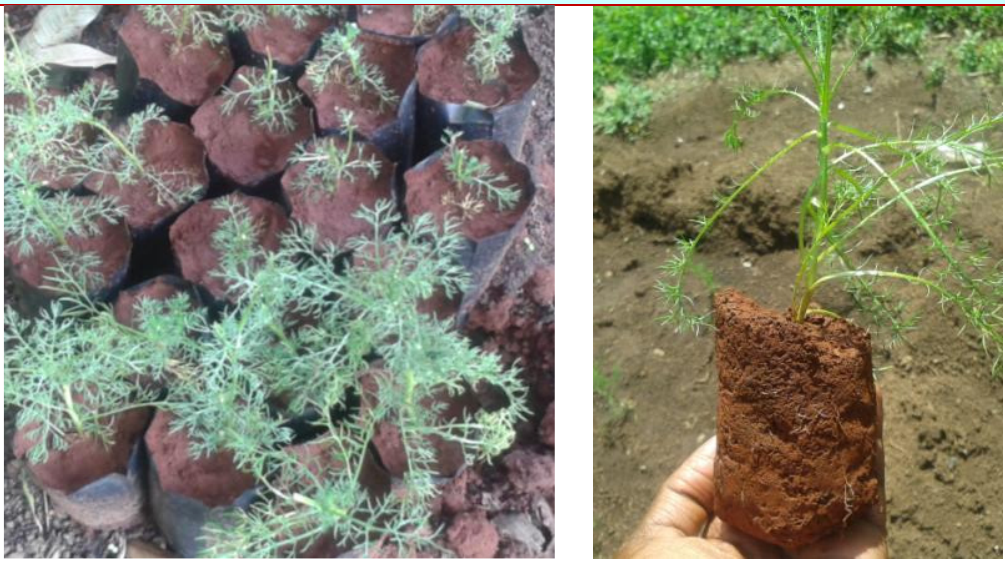
Chamomile plants raised from cuttings (left); a sprouted cutting showing roots. Plants raised from cuttings flowered after 42 days.