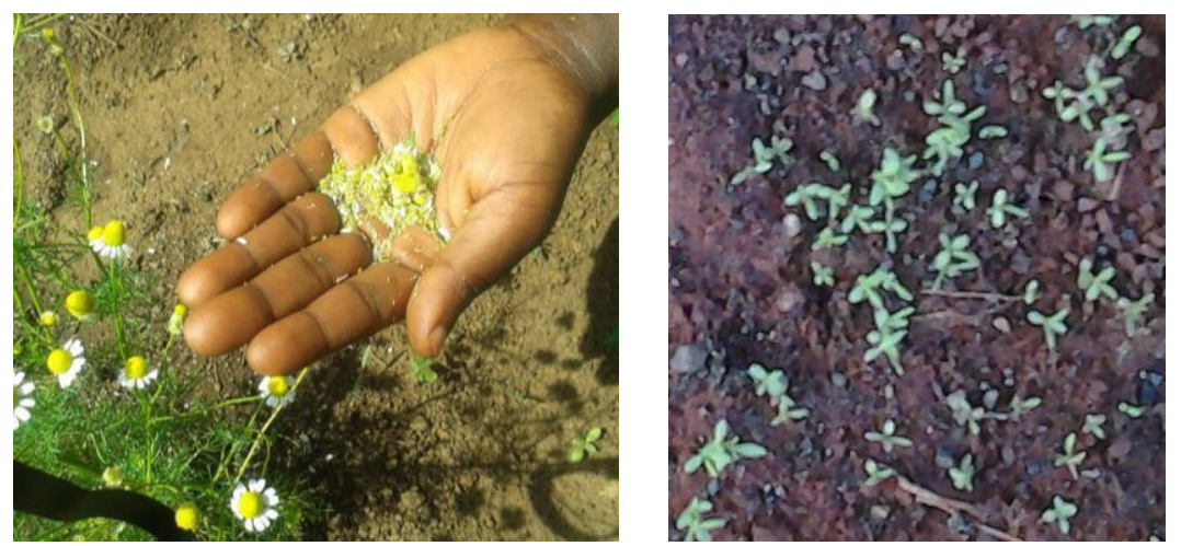
Seeds from chamomile plant (left); and seedlings germinating from seed (right). Plants raised from seed flowered after 77 days.