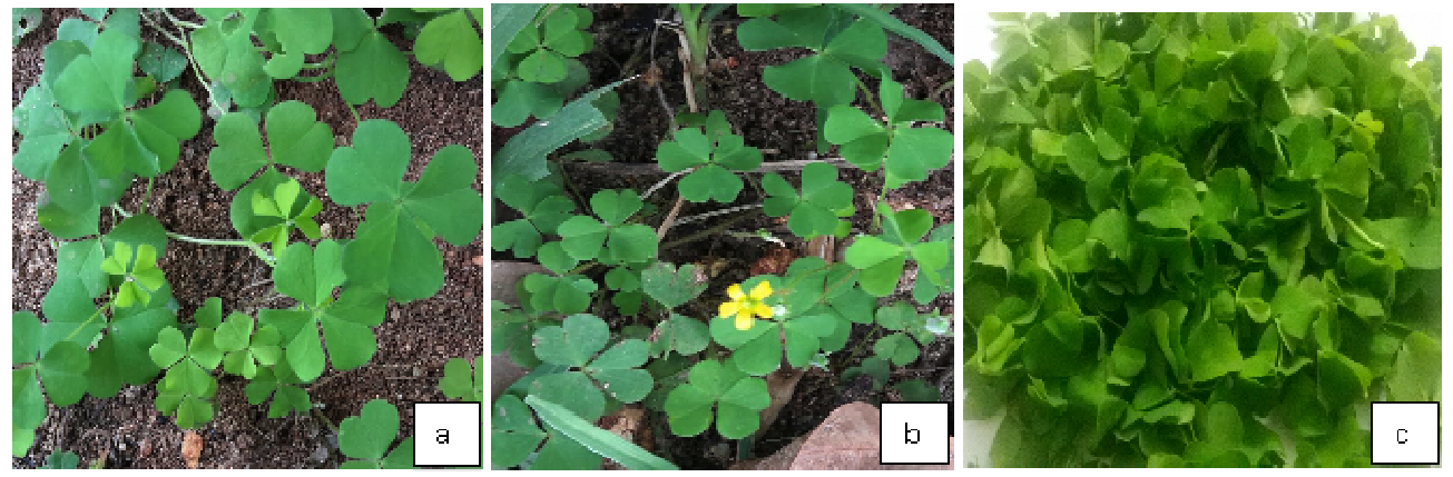
Figure 1: Oxalis corniculata (a&b) growing in garden (c) Fresh leaves collected for experimentation

2016. Plants were identified by a plant taxonomist from the Botany Department of the University of Dar es Salaam.