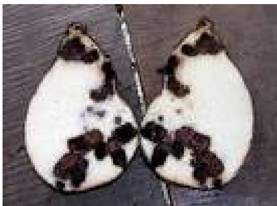
Figure 3: Picture of a yam damaged by nematode infections