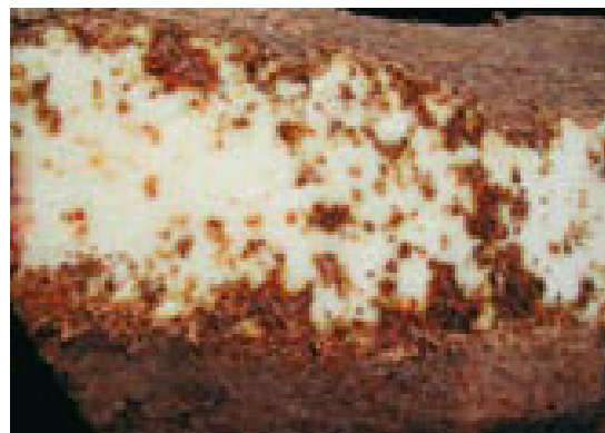
Figure 4: picture of internal lesion and necrosis caused by nematodes on a yam.